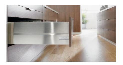
TANDEMBOX Stainless with BoxCap

TANDEMBOX drawers open smoothly and close quietly thanks to their integrated soft close feature. Every TANDEMBOX drawer is full extension, meaning you'll have access to everything in the drawer, even the items in the back.