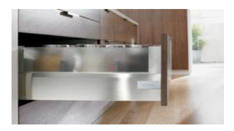
TANDEMBOX Stainless with glass design element